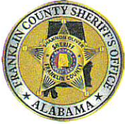
SHANNON OLIVER SHERIFF