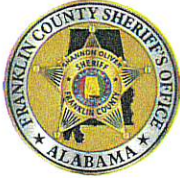
SHANNON OLIVER SHERIFF