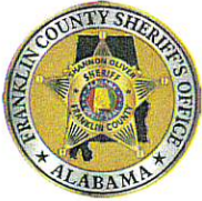
SHANNON OLIVER SHERIFF